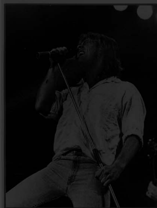
BAD COMPANY (Brian Howe): draw on your own tattoos an' whack it on the wall!