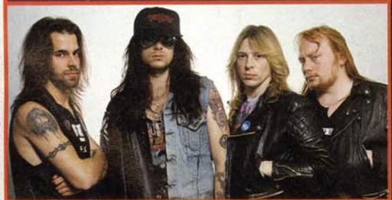
THE ALMIGHTY

THE ALMIGHTY Wild, wonderful... and wather good, ackshully!